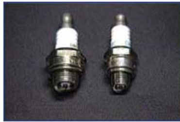
New compact plug