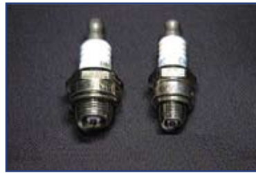
New compact plug